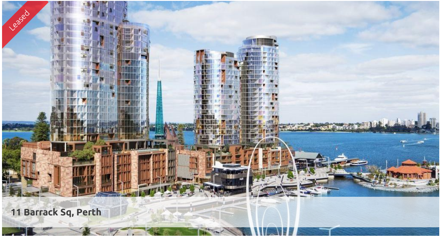
11 Barrack Sq, Perth